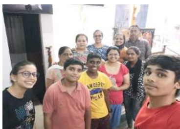
Live the Word Hub-Nerul