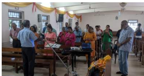
Live the Word Animators Workshop, Goa