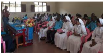
'Being a Witness' - St Anne's Convent Staff