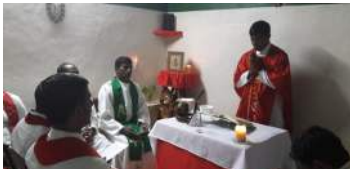
Eucharistic celebration in the community chapel, Mangochi