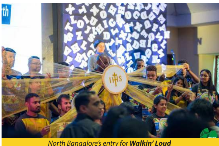
North Bangalore's entry for Walkin' Loud

Day One began with the first competition of the Conference, "Walkin' Loud". This Competition required each delegation to focus their energy, vibrancy and creativity in a manner that best brought out the pulse of their area, with a twist to it – each delegation had to depict this as a human flag. Every delegation showcased skill, creativity and originality in the uniqueness of their depiction.