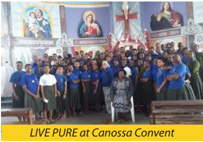
LIVE PURE at Canossa Convent

In Dar E Salaam, we gave a variety of programs to different sections of people. LCSC to parishioners, Catechists, Associations and even to a group of fifty kids. Several sessions on "Living our Vocation to