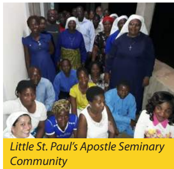
Little St. Paul's Apostle Seminary Community