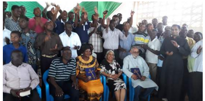
LCSC & Intercession Program at Msumi Parish