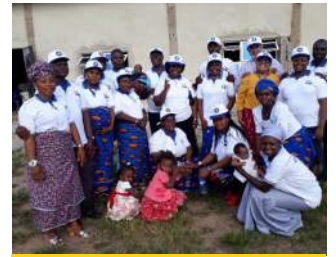
CFC training programs, Nigeria

We have been exposing them to Vision and Mission of CFC, an appreciation of the CLS and purpose and dynamics of Households besides a session on "Family Financial Planning" and other sessions on married life. Their zeal is amazing. We left them with instructions on how to conduct the CLS, Household meetings and Chapter meetings. God grant them grace to build His Kingdom in Abuja.