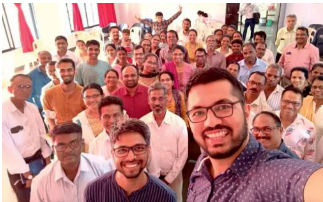
Live Life- Vapi

Thus far, we have conducted such programs for