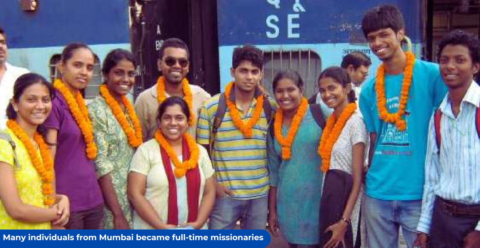
Many individuals from Mumbai became full-time missionaries