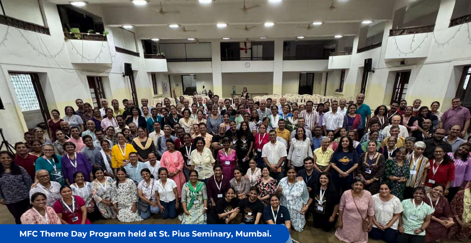
MFC Theme Day Program held at St. Pius Seminary, Mumbai.