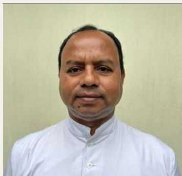
MFC programs are inspiring