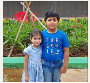
Loves MFC Kids Meeting