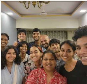
Healing of Bipolar Disorder