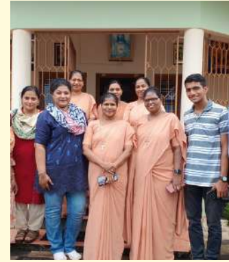
The students of St Charles during the retreat

We are grateful to the Missionary Families of Christ for their tireless efforts in organizing this event. We believe that the lessons learned and the values instilled during the retreat will continue to inspire and guide the students in their spiritual journey.